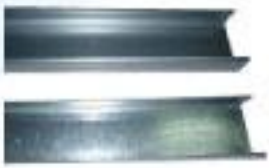
GI U Cleat Standard Length 1.2 & 2.4 Meter