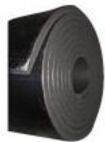
Polyolefin Foam Roll