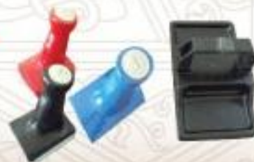
Pre Insulated Cutting Tools (4 pcs/Set)