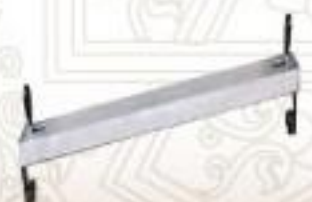
Clamping Ruler 1200mm & 4000mm