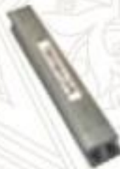
PVC H Bayonet