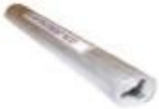
Aluminum Reinforcement Bar