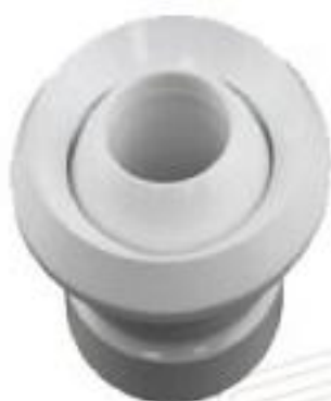
Ball Jet Diffuser