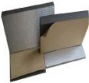
Polyolefin Foam Insulation Sizes Available 13mm, 19mm, 25mm & 50mm Thickness