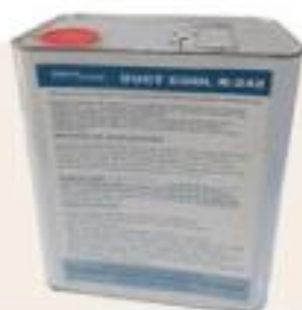
Duct Cool R 242 Polychloprene Based Adhesive Packing:- 1 Gallon