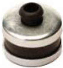
Anti vibration mounts Load Rating Range: 25kg & 50 kg