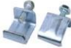
GI G Clamp Size: 40mm