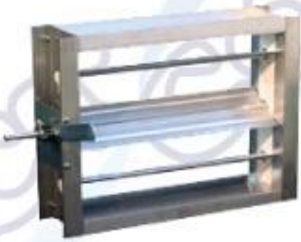
Volume Control Damper