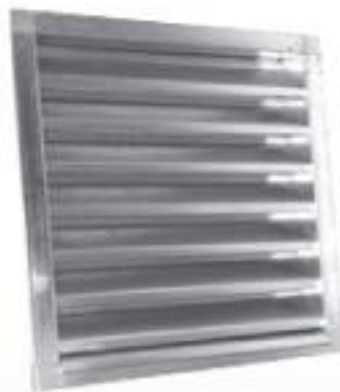
Stand Trap Louver