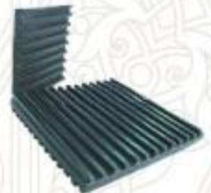
Ribbed Rubber pads Size: 18" x 18" x 3/8"Thickness