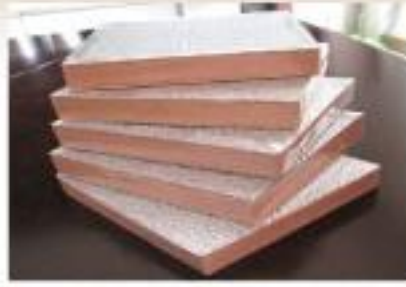
Pre Insulated Phenolic panel 20mm