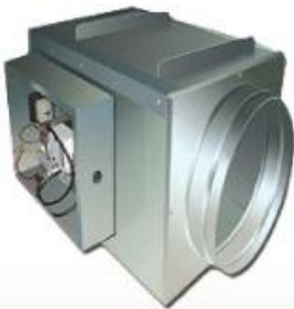
Variable Air Volume