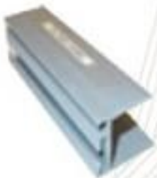
PVC Invisible Flange 20mm