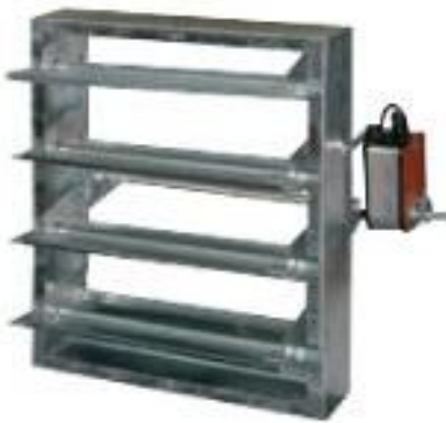
Motorized Volume Control Damper