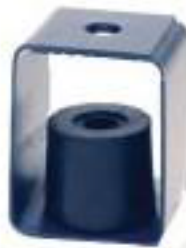
Anti Vibration Hanger Load Rating Range: 50 Kg & 75 Kg