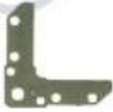
Duct Mate Corner Size: 20mm to 40mm