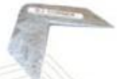
GI PIR Corner 20mm & 30mm