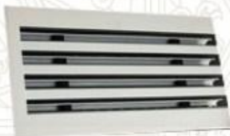
Linear Slot Diffuser