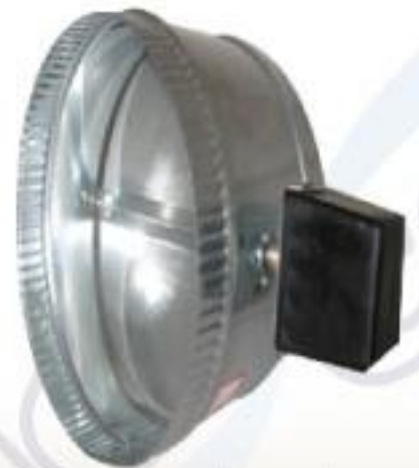
Motorized Round Volume Control Damper