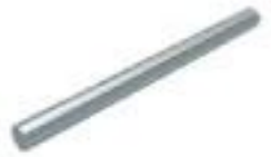
GI Threaded Rod Size: 6mm to 10mm