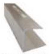
Aluminum U Profile 20mm & 30mm