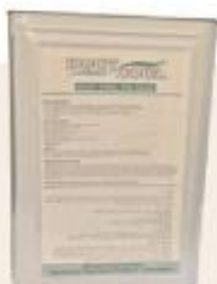
Duct Cool PIR Adhesive Packing:- 15 Liter