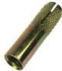
GI Unifix Size 6mm to 10mm