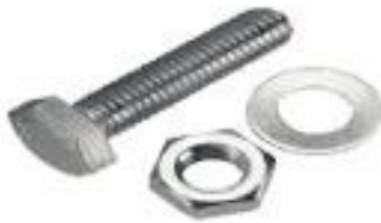
GI Bolt, Nut & Washer Size: 6mm to 10mm