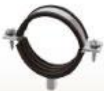
Split Clamp Rubber Clamps Size: 1/2" to 8"