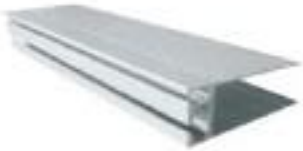
Aluminum Invisible 20mm & 30mm