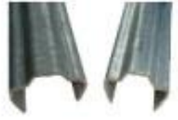
GI C Cleat Size 20mm & 30mm