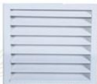
Exhaust Air Louver