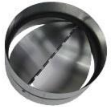
Back Draft Damper