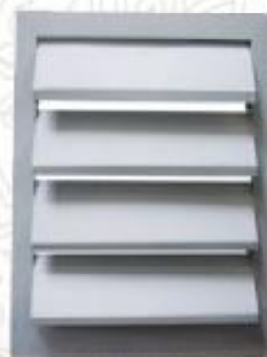
Non Return Damper