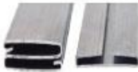
GI S & Cleat Standard Length 1.2 & 2.4 Meter