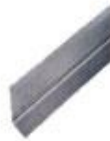
GI L Angle Size: 20mm & 30mm