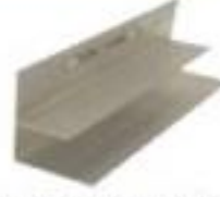
Aluminum F Profile 20mm & 30mm