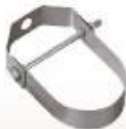
Clevis Clamps Size: 1/2" to 8"