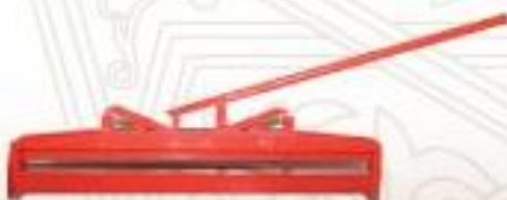
Pre Insulated Bending Machine