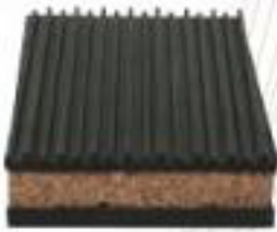
Cork Sandwich Pad Size: 18"x18"x7/8"Thickness 6" x 6" x 7/8"Thickness