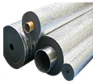
Polyolefin Pipe Insulation Available in various Thickness & Diameter