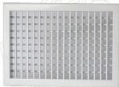
Linear Bar Grille & Registers