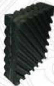
Metal Sandwich Pad Size: 6" x 6" x 1/4"Thickness 4" x 4" x 1/4"Thickness