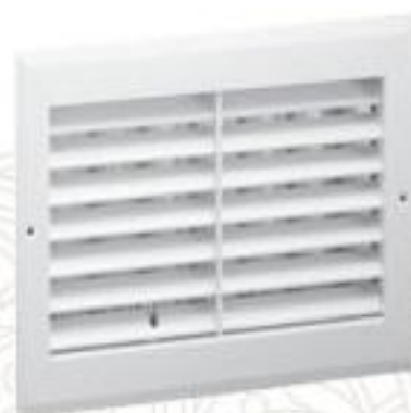
Grille & Registers