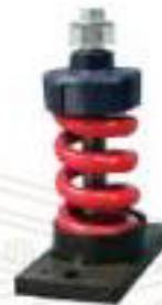
Spring Mounts Load Rating Range: 50Kg to 1200kg