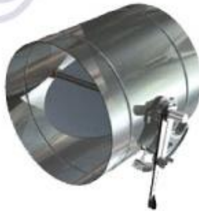
Round Volume Control Damper