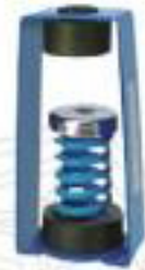
Spring Hanger Load Rating Range: 20kg to 300kg