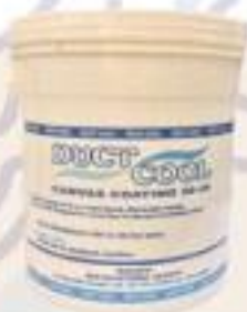
Duct Cool 30-36 Canvas Coat Packing:- 5 Gallon