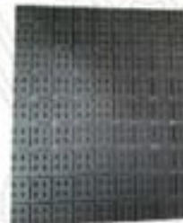
Waffle Rubber Pads Size: 18" x 18" x 1/4"Thickness