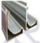
Duct mate Flange Size: 20mm to 40mm Standard length: 5 Meter