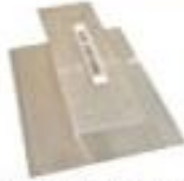
Aluminum Chair Profile 20mm & 30mm