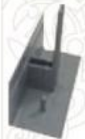
PVC Corner 1 Way Shape