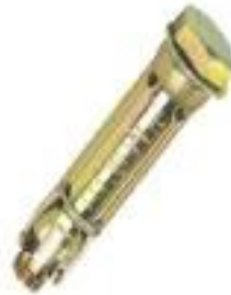
GI Fix Bolt Size 6mm to 10mm