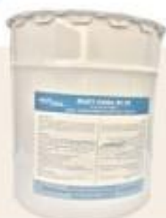
Duct Cool 81-10 Synthetic Bond Adhesive Packing:- 15 Liter