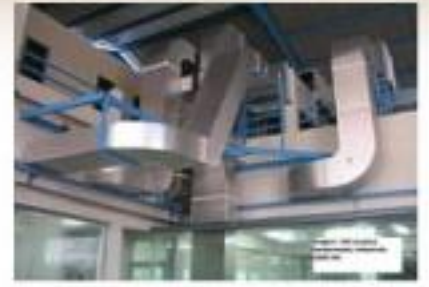
PIR Fabrication Images