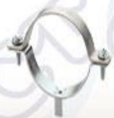
Plain Split Clamps Size: 1/2" to 8"